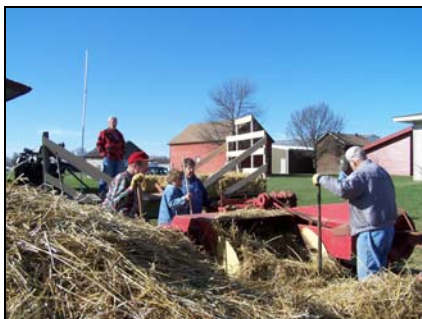
Our threshing crew takes a break while contemplating the next bit of work needing to be done. Thanks to everyone who helped out that day to get the work done!

For more info on these events, call us at (507) 437-6082.