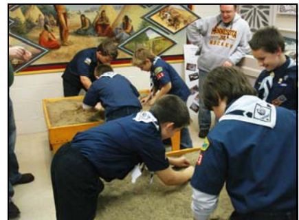
Members of Den 4 Pack 113 of Austin Cub Scouts visited the Herald J. Williams Indian Building on October 19.